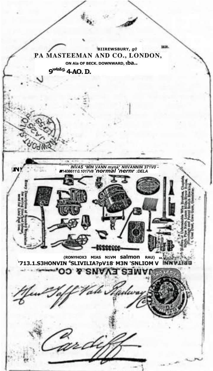
1851 1d PINK ENVELOPE WITH PRINTED FLAP, part shown; KEVII NEWSPAPER WRAPPER PRIVATELY OVERPRINTED.